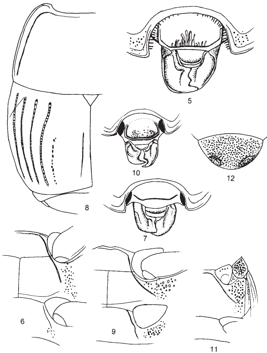
Figs. 5-12. 5- Geminorhabdus crenulistrius ; 6- G. marshalli ; 7-9- G. mayumbensis ; 10-11- G. simulans ; 12 - pygidium of "sulcipygus"; 5, 7, 10- head; 8- left part of pronotum and elytron; 6, 9- lateral part of meso- and metasternum; 11- lateral part of metasternum.