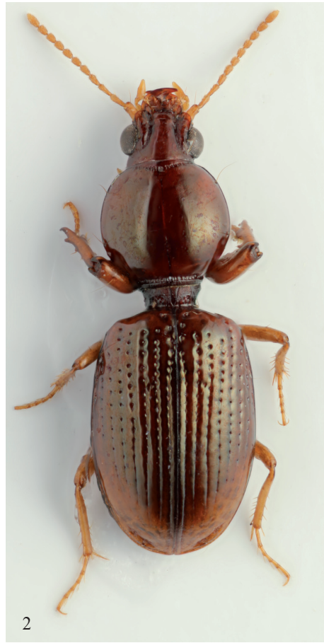
Figs 1-2. Habitus of HT (actual length in parentheses behind the name). 1- D. kirschenhoferi sp. nov. (3.15 mm); 2- D. magrinii sp. nov. (4.95 mm).