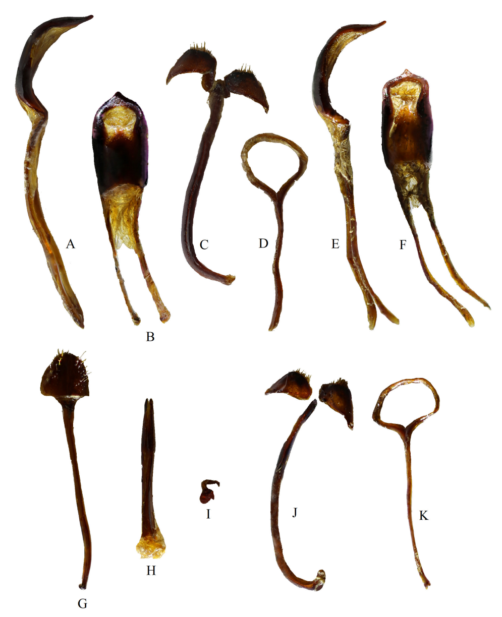
Fig. 2. Genitalia of P. mindoroensis sp. nov.: A- aedeagus in dorsal view; B- aedeagus in lateral view; C- sternite IX in ventral view; D- tegmen in ventral view; G- sternite VIII in ventral view; H- apex of ovipositor in dorsal view; I- spermatheca; genitalia of P. chlorites : E- aedeagus in dorsal view; F- aedeagus in lateral view; J- sternite IX in ventral view; K- tegmen in ventral view.