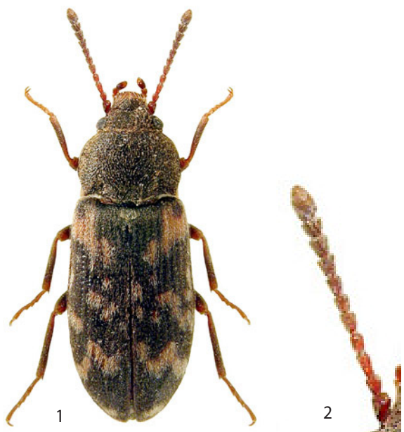
Figs. 1-2. Arnoldiellus tschitscherini (Reitter, 1897) comb. nov.: 1- habitus, dorsal aspect; 2- antenna (according to http://www.cassidae.uni.wroc.pl ).

Distribution. Species known from Latvia, Russia, Sweden, Mongolia, North Korea (Háva 2022).